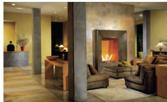
Hotel Healdsburg lobby

DestinationCME presents up-to-date clinical learning in a relaxed atmosphere. Designed to meet the of anesthesia professionals, each meeting combines the best of all worlds— an exceptional destination, renowned faculty, intimate classroom settings, informal networking, and