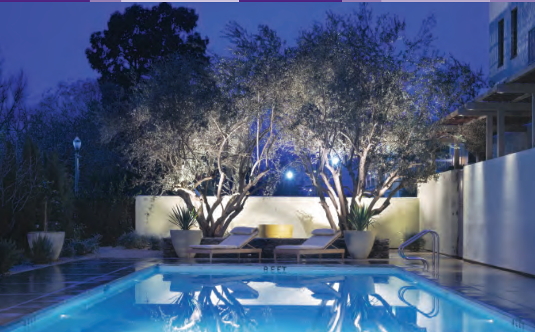
Hotel Healdsburg pool