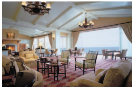
Montage Resort & Spa lobby

DestinationCME presents up-to-date clinical learning in a relaxed atmosphere. Designed to meet the specific educational needs of anesthesia professionals, each meeting combines the best of all worlds—an exceptional destination, renowned faculty, intimate classroom settings, informal networking, and an