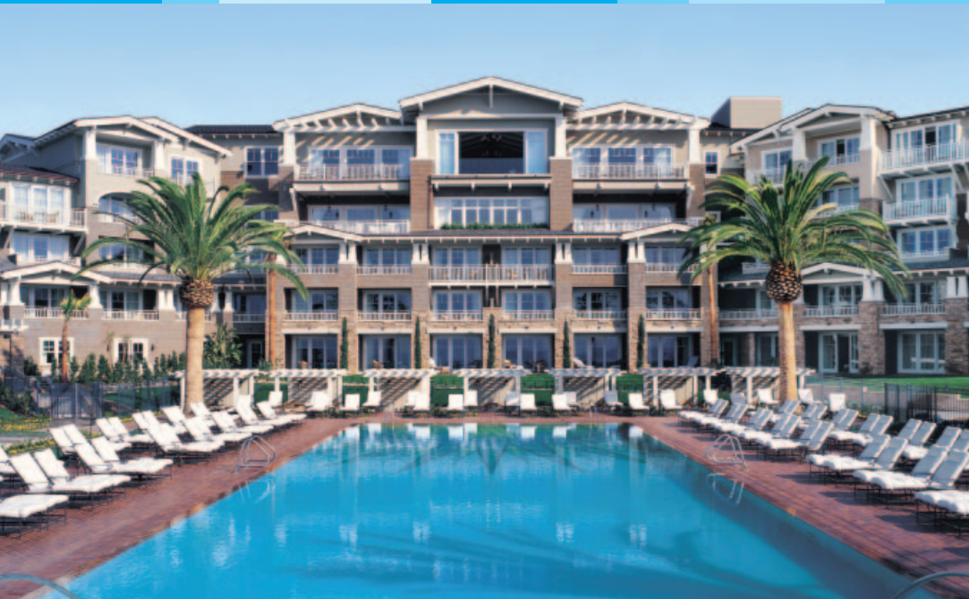
Montage Resort & Spa pool, view from ocean