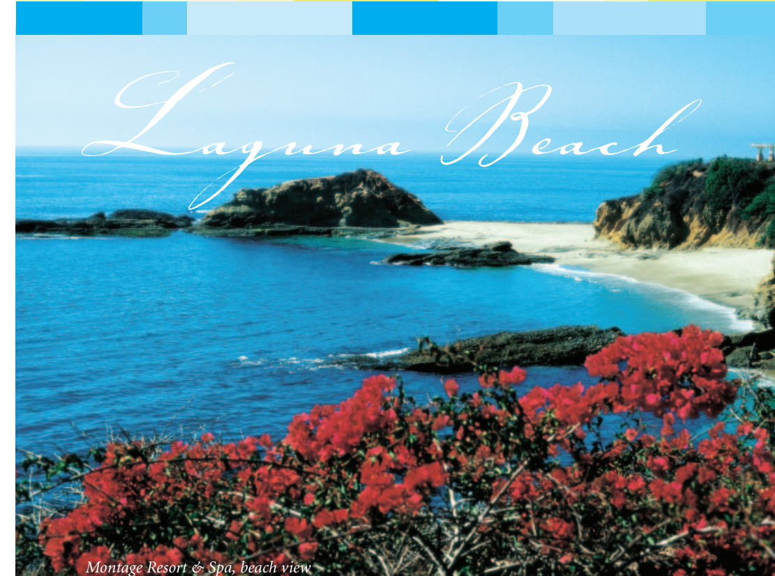
Montage Resort & Spa, beach view