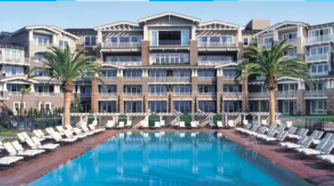
Montage Resort & Spa pool, view from ocean