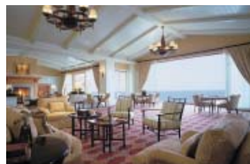
Montage Resort & Spa lobby

DestinationCME presents up-to-date clinical learning in a relaxed atmosphere. Designed to meet the specific educational needs of anesthesia professionals, each meeting combines the best of all worlds—an exceptional destination, renowned faculty, intimate classroom settings, informal networking, and an outstanding menu of amenities