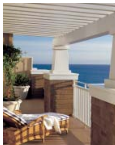
President's Suite Balcony

A block of rooms has been reserved at Montage Resort & Spa at the rate of $295 per night, single or double occupancy, run of house, which is applicable three days before and three days after the meeting. You must register and pay for the conference before making your room reservations. A room reservation form will be sent with your conference confirmation.